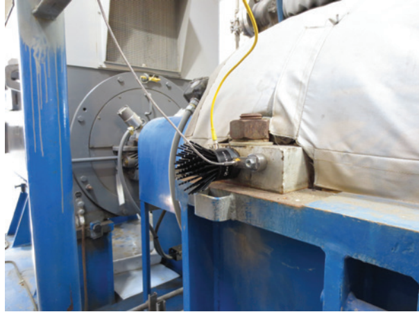
FIGURE 3: Hot Boiler Feedwater Pump (foreground). Again, the surface temperature sensor used for engineering data collection is visible in this photo, next to the Power Puck. The air-cooled pump drive motor is at the left side of this photo, and the wSIM is just outside the field of view at the top.