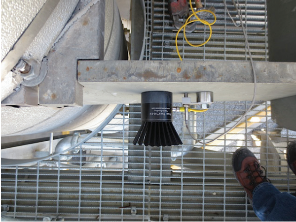
FIGURE 1: Warm Gland Seal Condenser support structure, with magnetically-mounted Power Puck and the thermocouple being used to monitor surface temperature for data collection. The temperature signal was processed and transmitted by the wSIM that the Power Puck was energizing.