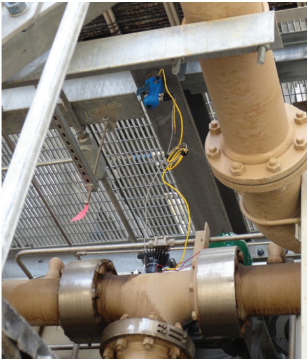
FIGURE 2: Hot Boiler Feedwater Line. In this example, the wSIM was hanging upside down from the overhead structure and the Power Puck was attached on top of the piping tee at the bottom of the photo.